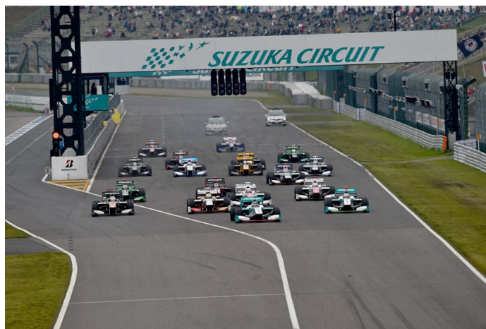
Start of the opening race of the 2016 season (Suzuka Circuit)

Hitachi Automotive Systems will continue to use its sponsorship of motor sports, including the Japanese Super Formula Championship Series, to further grow the Hitachi brand and contribute to motor sports.