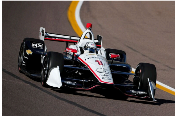
Test driving in Phoenix in February