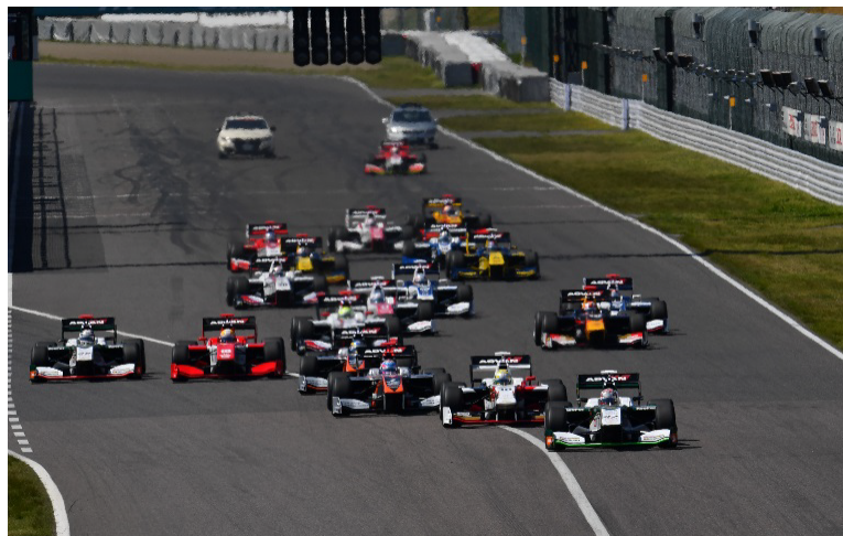
Start of the opening race of the 2017 season (Suzuka Circuit)