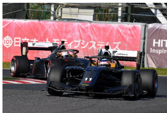
The new SF19 car undergoes testing