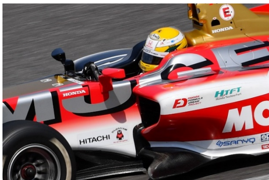
The car that won the 2018 championship