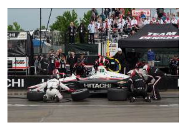
The pit crew switches tires with precision timing